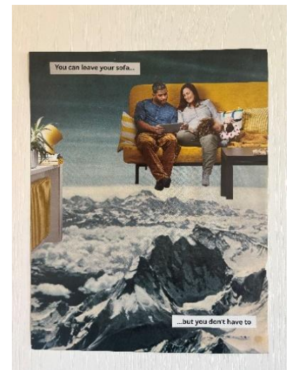
Sofa Journey Collage, Magazine Jaclyn Bell

Februllage: Scavenging Through the Years showcases a collection of daily collages created in response to one-word prompts from the global February art challenge, Februllage. Built from found magazine images and guided by instinct, humor, and the joy of spontaneous creation, these works capture moments of curiosity and play across multiple years of participating in the global challenge. Viewers are invited to interact with the exhibit in their own way—by guessing the prompts behind each collage or using the provided guide to uncover them as they explore.