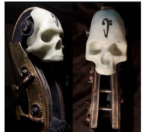
Untitled Painting in Acrylic and Mixed Media and Untitled Sculpture with Cello and plaster, both by Ryan Boyd