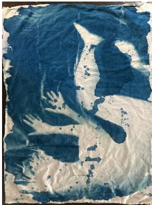
Untitled Cyanotype Dye Vivian Smith, 2021