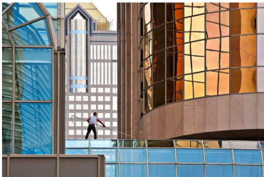
Window Washer above