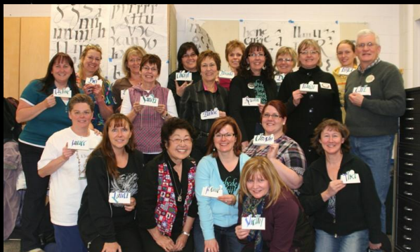
Lettering Arts Guild Members, 2010