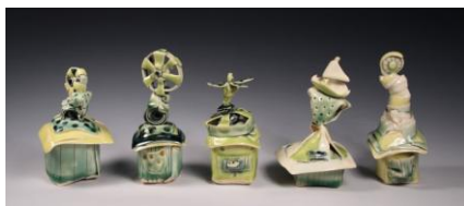
Loves-me-love-me-not, Performance & Installation, 2014, Keszckemet, Hungary

I look forward to the next year, the challenges, the discoveries and the world that seems full of potential!