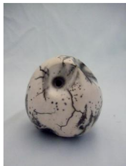
Owlet Naked Raku, 2012 ($80.00) Carol Nault