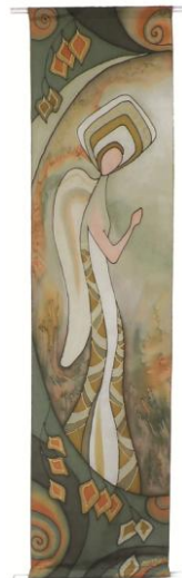
Gratitude Angel Hand Painted Silk, 2011 ($198.00) Darcy Gusse Edinga