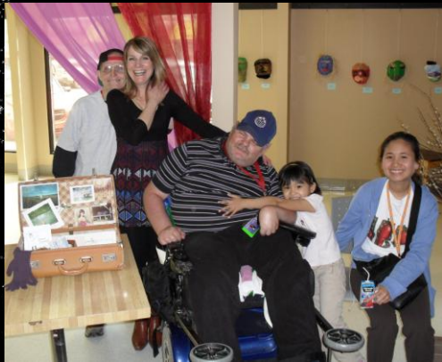
Just hanging out at the Hub on Ross, 2012 "Community, Connect, Belong"

We are friends, soul mates, children, siblings, mothers, fathers and grandparents.