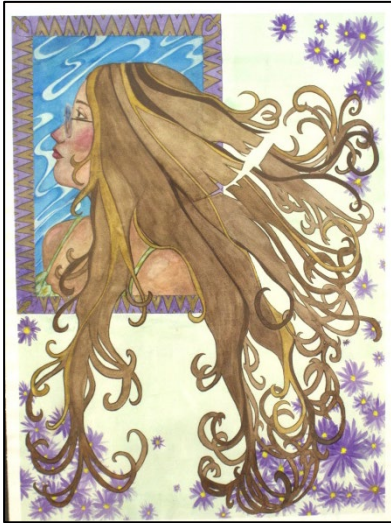
Cut Deneen Hawryszko, 2025 Watercolour, acrylic paint, acrylic ink on paper

This exhibition showcases the new artistic discoveries of these young artists. From paintings to ceramics, to prints and drawings and beyond, our next generation of young artists is ready to show their creations. Explore their work with them.