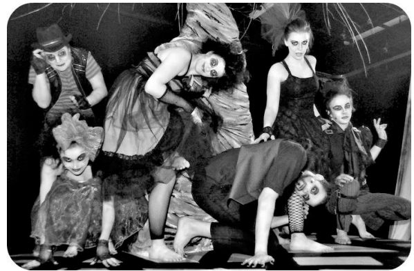
Dead Lover's Day Production by Against the Wall Theatre

Look for Bullskit productions this fall.