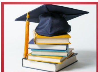
Red Deer Arts Council Scholarships & Awards

Applications for our scholarships and awards are available on our website! We help fund continuing education and artistic developments through the following five scholarships: