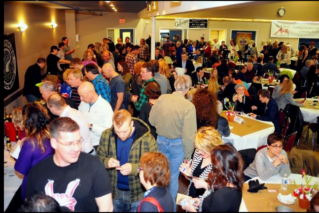
Craft Beer Tasting at the Arts & Craft (Beer) fundraising event, 2015 and a good time was had by all!