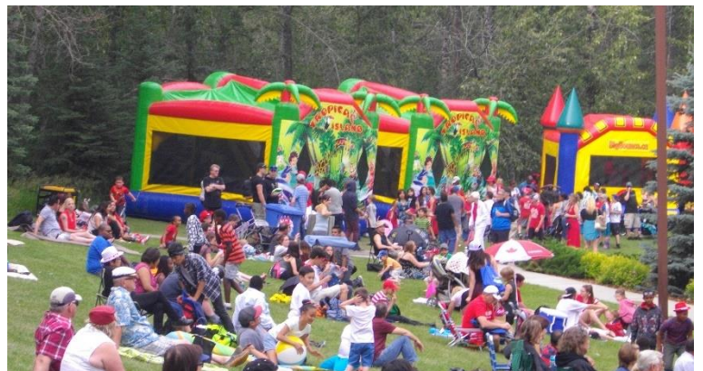
Crowds gather in the natural amphitheatre at the Bower Ponds Stage for Canada Day celebrations each year.

For more information on the Cultural Heritage Society or to book Cronquist House or Festival Hall, visit rdchs.com or call 403-346-0055.