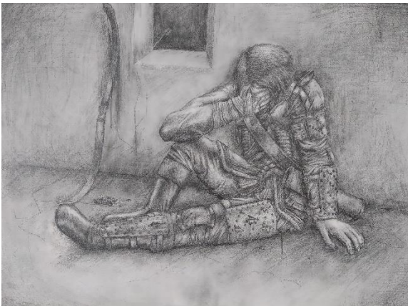
Weeping Archer Graphite Jaben Belder Ecole LTCHS

First Friday Red Deer Opening June 3 rd from 5:30 – 7:30 pm