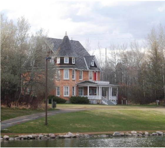
Cronquist House at Bower Ponds is home to the Red Deer Cultural Heritage Society. The three-storey home was rescued by the society from demolition in the mid-1970s.