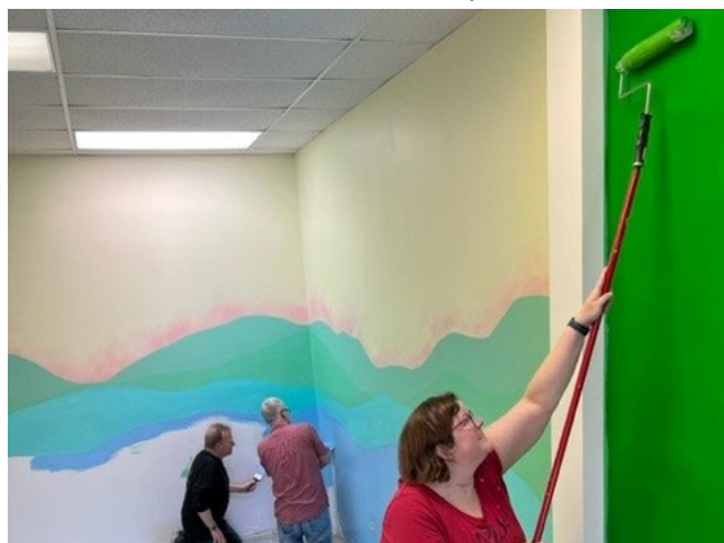
Many volunteers have helped paint and decorate the new space over the past few weeks!