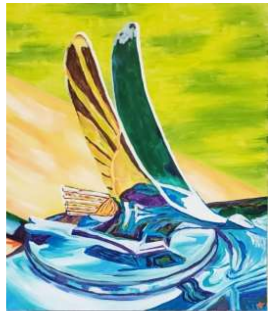
Hood Acrylic, 2020 Amanda Frost