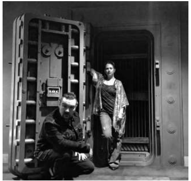
Wiklund vs Wiklund will perform at the Jewel Theatre in Stettler March 5.

For additional information about upcoming performances, visit wiklundvswiklund.com .