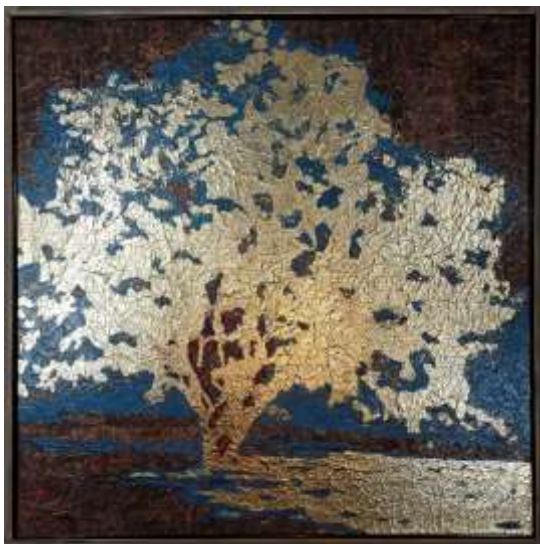
Be Golden Mixed Media Collage, 2015 Lorene Runham

running until May 1 st , 2022 in the Red Deer Arts Council's Kiwanis Gallery.