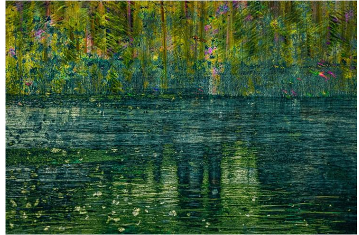
Hidden Pond Photograph on Archival Paper, 2022 Barb Kreutter

#FirstFridaysRedDeer Opening Reception January 5 from 5:30–7:30 pm with the artists in attendance.