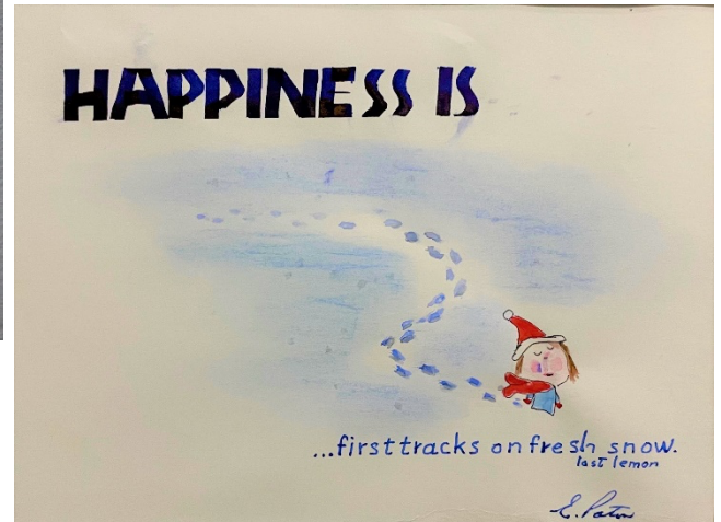
Happiness Is Watercolour/Ink Echo Paton