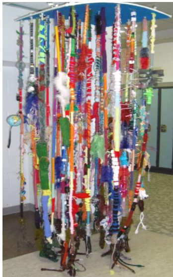
Sculpture, Mixed Media, Grade 7, Westpark Middle School Students