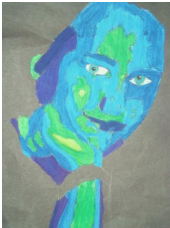
Portrait, Oil Pastel, Grade 8, Westpark Middle School