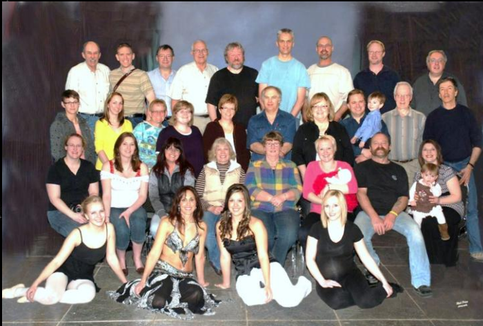
Central Alberta Photographic Society members pose with portrait workshop models, 2010.

We are auto mechanics, farmers, business people, someone's Mom, Father and family members. We love photography in all its forms. We are artists! We are proud to call Red Deer home.