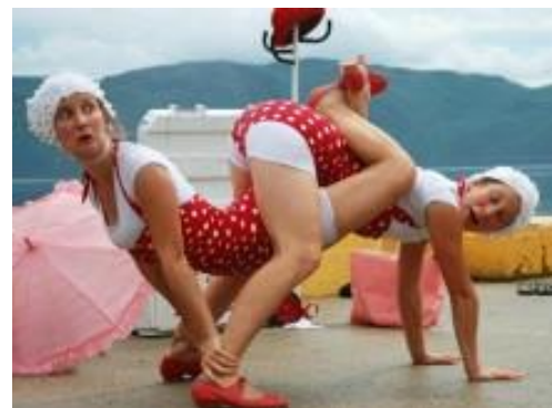
The Kif-Kif Sisters from Quebec are just one of the acts for Centrefest!

Join Us on July 25th for a sneak peak at the ATCO Gas Kick-Off Barbecue at City Hall Park.