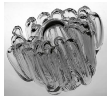
Anemone, Glass, 2013 Larissa Blokhuis