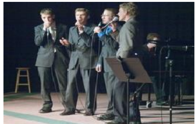
Quartet Performing at the Festival, 2012

We welcome you to join in the celebration the fiftieth edition of the Red Deer Festival of the Performing Arts this April.