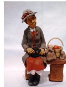
Rosie with Picnic Basket, Ceramic, Mo Leaney