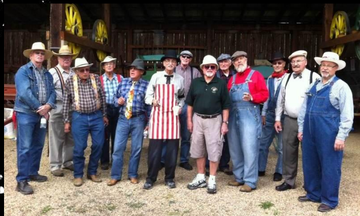
The WildRose Harmonizers at Sunnybrook Farm Days (2014)

We are a group of men who love to sing for fun and enjoyment.