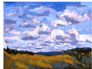
Sky, Oil, 1989, Art Whitehead